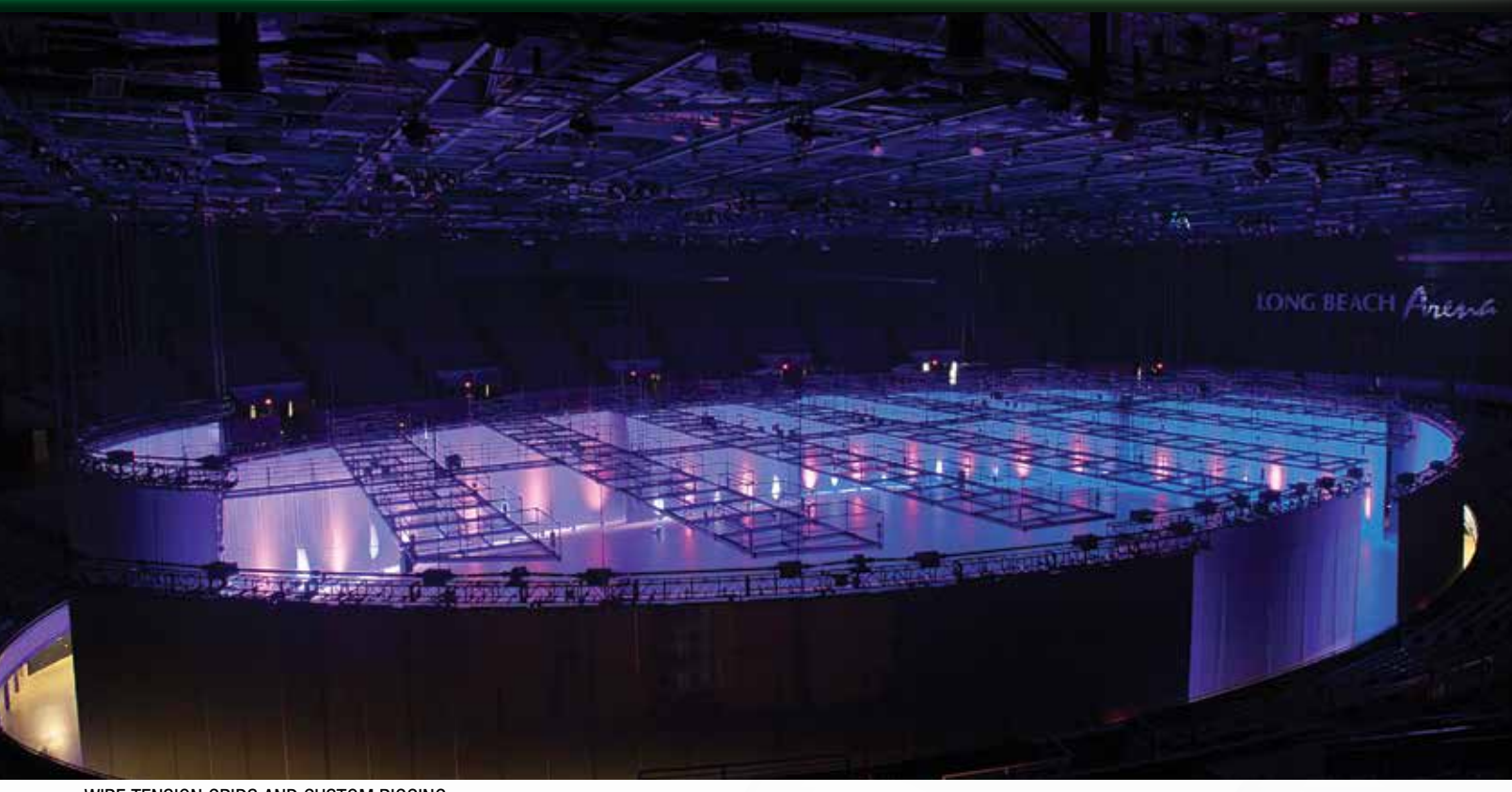
WIRE TENSION GRIDS AND CUSTOM RIGGING

"We can do receptions, we can do pop concerts, we can do auto shows with individual lights on the autos. We have lights installed, and sound installed. This breathes new life into an existing space."