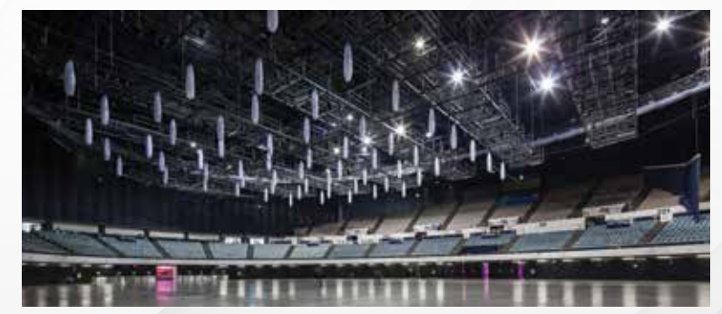
TRUSS, LIGHTING, DIVIDER CURTAINS, CONTROL SYSTEM, WIRE TENSION GRIDS AND CUSTOM RIGGING SYSTEM

Charlie Bierne General Manager, Long Beach Convention and Entertainment Center